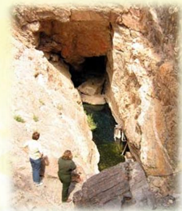
Photo: Devils Hole