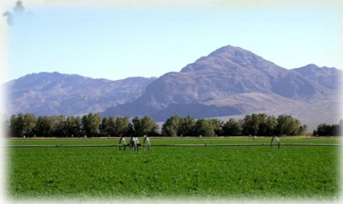
Photo: Alfalfa field in Amargosa Valley